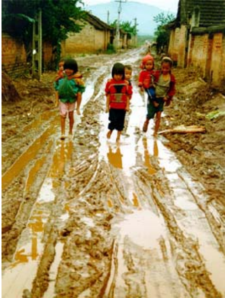
A new road to future

Development and environment are interrelated to each other. Improper or uncontrolled development is likely to cause adverse impacts on the environment, and environmental pollution or degradation may become a major obstacle for social and economic development. The interrelationship between development and environment has been observed throughout the world, especially in fast-developing countries such as Japan, South Korea, China, and Thailand (1,2). Recognizing detrimental effects of environmental pollution and degradation on sustainable development, the United Nations Conference on Environment and Development, which was held from June 3 through June 14, 1992 in Rio de Janeiro, Brazil discussed and agreed on several global environmental issues including non-binding statements on the relationship between sustainable environmental practices and the pursuit of social and socioeconomic development. One of these agreements was Agenda 21, a wide-range assessment of social and economic sectors