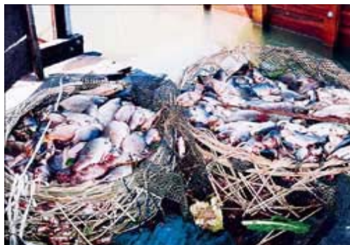
Aquacultural fish killed by water pollution in Dong Nai River

The environmental pollution has already shown its impacts on the social and economic development in Vietnam. Water pollution has reduced availability of fresh water, killed aquacultural fish in rivers (29,30), and damaged crops and plants along polluted canals and rivers used as sources for irrigation water (31). “The World Bank is soliciting bids for a $150 million project to build new raw water mains, expand and update treatment plants, and lay distribution piping in four large cities” (3). Because of the use of chloramphenicol and nitrofurans to cope with water pollution, “... the Vietnam’s seafood industry has lost scores of US dollars recently” (32). Costs for