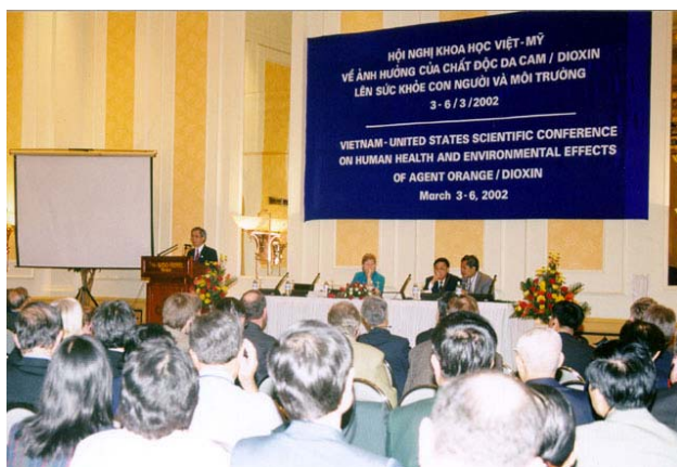
US-Vietnam conference on dioxin in Hanoi

Although environmental protection has been strengthened during the last decade, the Vietnam environment continues to degrade. “The socio-economic development process during the industrialisation period, together with urbanisation and rapid population growth exerts a high pressure on the environment and natural resources. The forest area continues to be degraded and destroyed. Mineral products are still exploited recklessly. Land and soil are being eroded and degraded. Both terrestrial and marine biodiversity have gradually been depleted. The surface water and ground water resources are more and more polluted and face the risk of depletion in some regions. Water pollution has also started to occur in coastal areas. The environment around many urban centres and industrial areas has been polluted by wastewater, emissions and solid wastes. Environmental sanitary conditions in rural areas are still very poor...” (8)