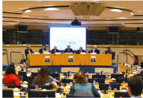
Hearing in European Parliament on organ harvesting on 29 Jan, 2013

In September 2006, the European Parliament conducted a hearing and adopted a resolution, condemning the detention and torture of Falun Gong and expressing concern about organ harvesting. The issue was also raised by direction of the EU troika leadership through the Finnish foreign minister meeting bilaterally with China's counterpart at the EU-China summit that year in Helsinki.