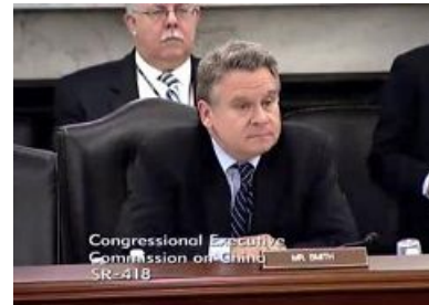
Rep. Chris Smith

On Oct. 3 2012, 106 Members of Congress wrote then Secretary of State Clinton, urging her to release information on organ pillaging in China from Falun Gong and other religious and political prisoners, and for the release of any information it might have that former Chongqing deputy mayor Wang Lijun, who was directly involved in organ harvesting practices, provided during his sanctuary in a U.S. consulate in February.