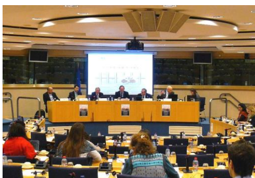
Hearing at European Parliament on pillaging, 29 Jan, 2013

In September 2006, The European Parliament conducted a hearing and adopted a resolution condemning the detention and torture of Falun Gong practitioners, and expressing concern over reports of organ harvesting; the issue was also raised by direction of the EU troika leadership through the Finnish Foreign Minister meeting bilaterally with China's Foreign Minister at the EU-China summit that year in Helsinki.