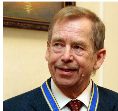
The late Vaclav Havel