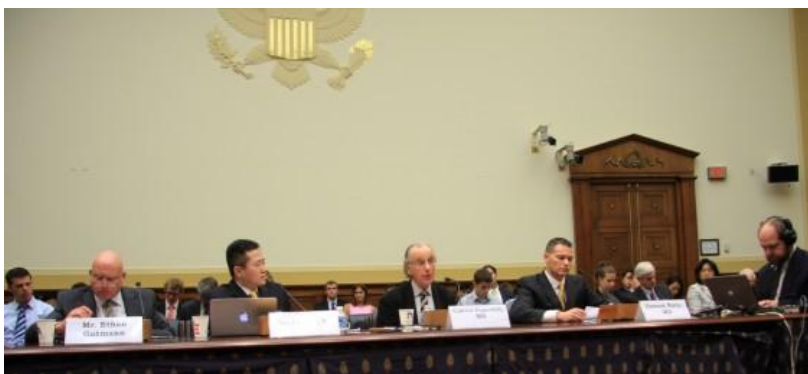
US Congressional Committee in hearing

http://commdocs.house.gov/committees/intlrel/hfa30146.000/hfa30146_of.htm