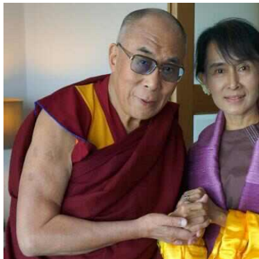
Dalai Lama and Aung San Suu Kyi

The late Vaclav Havel was threatened that his country would lose exports to China if he invited the Dalai Lama to Prague. The visit took place and nothing appears to have been lost. When Prime Minister Harper stood up to Beijing after 2008, similar threats were made. Bombardier Inc announced one of its biggest contracts ever in China not long after our prime minister did spoke about Canadian values in the world. In short, bluster aside. the Party in Beijing appears to respect those who stand up for universal values.