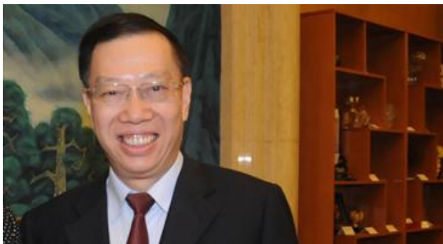
Former Vice Minister of Health HUANG Jiefu