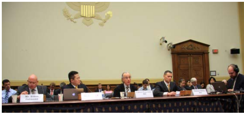
US Congressional Committee in hearing