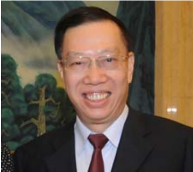
Recently removed Vice Minister of Health HUANG, Jiefu

The government of China now accepts that sourcing of organs from prisoners is improper. Former Vice Health Minister Huang Jie in 2009 said that executed prisoners “are definitely not a proper source for organ transplants.” In 2005, he admitted that over 95% of the organs transplanted in China came from executed prisoners. The party-state had denied using prisoners’ organs prior to this admission. Huang has admitted to doing 100 liver transplants yearly himself.