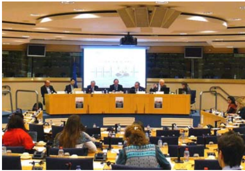
Hearing at European Parliament on pillaging, 29 Jan 2013

In September 2006, The European Parliament conducted a hearing and adopted a resolution condemning the detention and torture of Falun Gong practitioners, and expressing concern over reports of organ harvesting; the issue was also raised by direction of the EU troika leadership through the Finnish Foreign Minister meeting bilaterally with China's Foreign Minister at the EU-China summit that year in Helsinki.