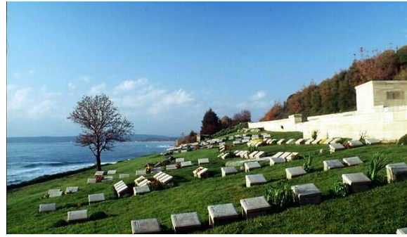
Anzac Cove, Gallipoli, (Daily Telegraph)

Having visited Gallipoli in Turkey a few years ago, I know the brave and determined nature of Australians and New Zealanders. Last weekend, I noticed on the window of a Melbourne clothing store a quotation from Thucydides, “The secret of freedom is courage.” When some Australians claim that your governments are afraid to stand up to the party-state in China on organ trafficking out of fear of losing export markets, I cannot agree.