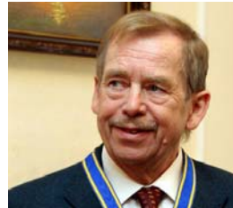
The late Vaclav Havel