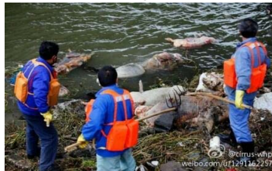
Sanitation workers (L) collect a dead pig from Shanghai's main waterway on March 11, 2013. Over 6,000 dead pigs have been found floating in Shanghai's main waterway, and residents have expressed fears over possible contamination of drinking water.