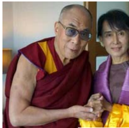
Dalai Lama and Aung San Suu Kyi

The late Vaclav Havel was threatened that his country would lose exports to China if he invited the Dalai Lama to Prague. The visit took place and nothing appears to have been lost. When Prime Minister Harper stood up to Beijing after 2008, similar threats were made. Bombardier Inc announced one of its biggest contracts ever in China not long after Harper spoke about Canadian values in the world. In short, bluster aside, the Party in Beijing appears to respect those who stand up for universal values.