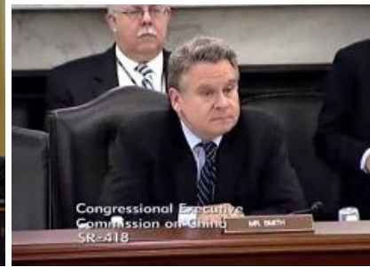
Rep. Chris Smith

On Oct. 3, 2012, 106 Members of Congress wrote to then Secretary of State Clinton, urging her to release information on organ pillaging in China from Falun Gong practitioners and other religious and political prisoners, and for the release of any information it might have that former Chongqing deputy mayor Wang Lijun is believed to have provided during his brief sanctuary in a U.S. consulate in February. Wang and Bo Xilai, both now in prison, were actively involved in organ pillaging.