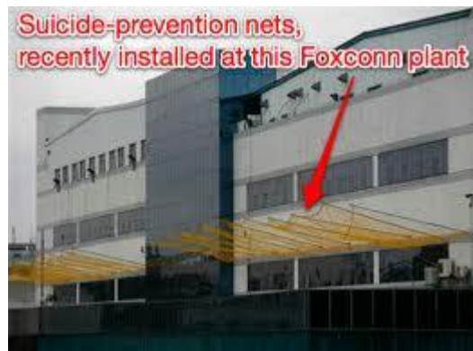
A Foxconn factory

Many know that the working conditions at Foxconn in China, where so many Apple products are manufactured, were so bad that in 2010 a number of employees killed themselves by jumping from the roof of one of its buildings. Both Apple and Foxconn have recently promised to improve, but how many other manufacturers across China continue to treat employees inhumanly?