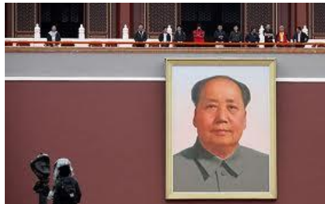
Mao portrait in Tiananmen Square today

As a university student, I valued my little red book of Mao Zedong's sayings and naively wanted to believe his then many apologists. A number of books, individuals and visits to China have since opened my eyes, but none more than Mao: The Unknown Story by Jung Chang (author of Wild Swans ) and Jon Halliday. Their meticulous research has demolished virtually every claim to legitimacy or respect for Mao.