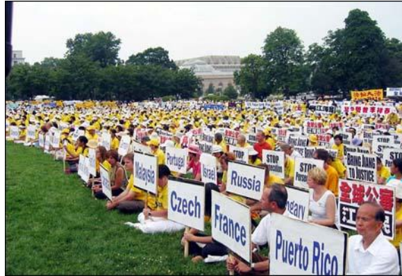
International gathering of Falun Gong practitioners

http://organharvestinvestigation.net/ or our 2009 book, Bloody Harvest , which is available in Mandarin and English.