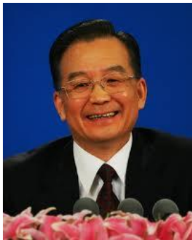
Premier Wen Jiabao

I admire the people of China greatly, including their often heroic protests against acts of misfeasance by their government. To his credit, the outgoing premier, Wen Jiabao, has spoken often about the necessity for democratic reform. He recently had a major role in blocking the advance of Bo Xilai to the nine-member Standing Committee of the Communist Party. Bo and his mentor, former President Jiang Zemin, have been among the worst offenders in the ongoing persecution of the Falun Gong movement since July, 1999. You might have noticed yesterday press reports from Beijing that Bo has been removed from his remaining posts and that his wife, Gu Kailai, is under investigation concerning the murder of a British citizen. The next to go will hopefully be Zhou Yongkang, the Party head of security, who worked closely with Jiang and Bo in the persecution of Falun Gong.