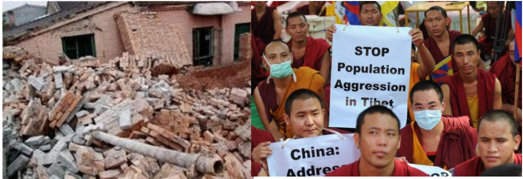
Christian house church destroyed

There is much on the Internet and elsewhere about party-state persecution of religions in general, but a reasonably current article, which I co-wrote can be accessed at http://david-kilgour.com/2011/convivium2011.pdf .